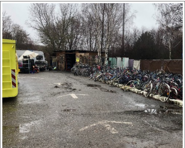
ON THE PREMISES